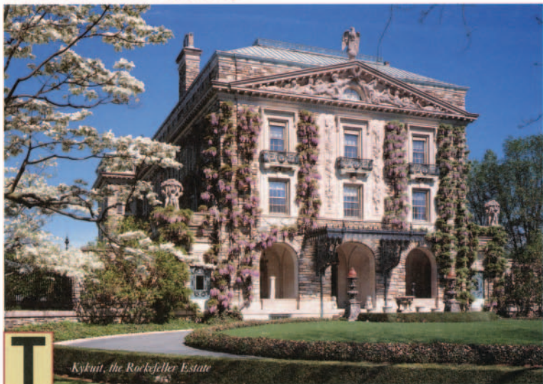
Kykuit, the Rockefeller Estate

You're Invited No Reservations Necessary