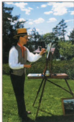
Artists on the Hudson at Sunnyside

This annual celebration of the early American circus brings an 18th-century traveling road show to life. Elephant and camel rides steal the show, but don't miss old-fashioned magic shows, tight-rope walkers, and other surprises. Picnic food is available. 10 a.m. to 5 p.m. Saturday through Monday. Call (914) 271-8981 for information.