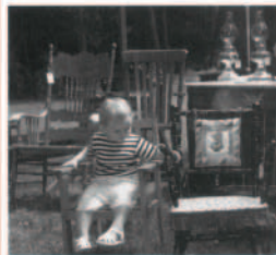
Antique show and sale at Montgomery Place

Dealers will offer an enticing array of fine antiques and collectibles. Booths are set on the broad shady lawns of this historic estate overlooking the Hudson River and Catskill Mountains. Delicious food will be for sale throughout the day. 10 a.m. to 5 p.m. Call (914) 758-5461. Admission is $6 per person, or free for children under 12 and Members.